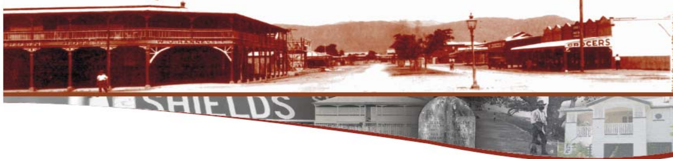
Shields Street early 20th century