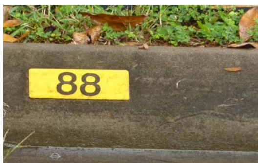
Example above showing where kerbside numbers are placed

Kerbside numbers are an additional aid to finding an address quickly and could save critical time in an emergency.