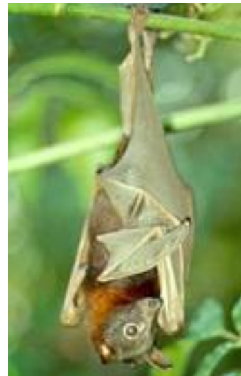
Little Red Flying Fox

Spectacled Flying Fox ( Pteropus conspicillatus ) is listed as Vulnerable under the Environment Protection and Biodiversity Conservation Act 1999 (EPBC Act).