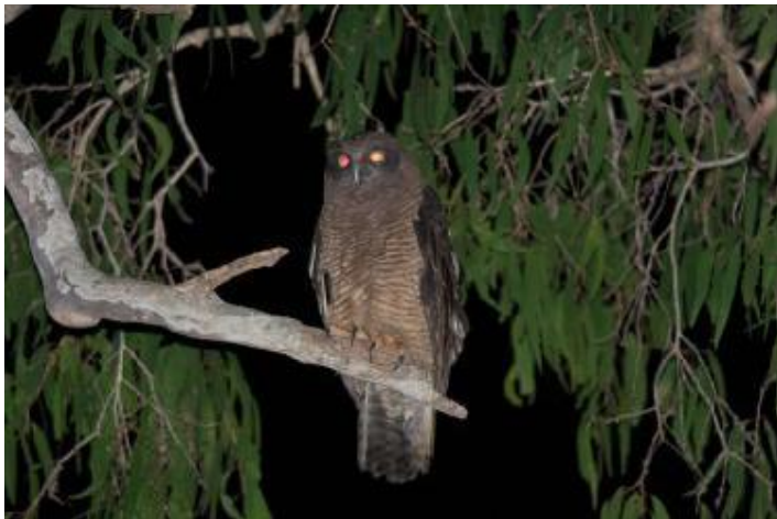
Rufous Owl

In October-November 2009 a pair of Rufous Owls nested in a deep tree hollow in a large Melaleuca tree adjacent to Saltwater Creek within Centenary Lakes. The Rufous Owl Management Program was created to assess whether removal of mangroves adjacent to Saltwater Creek would affect these owls.