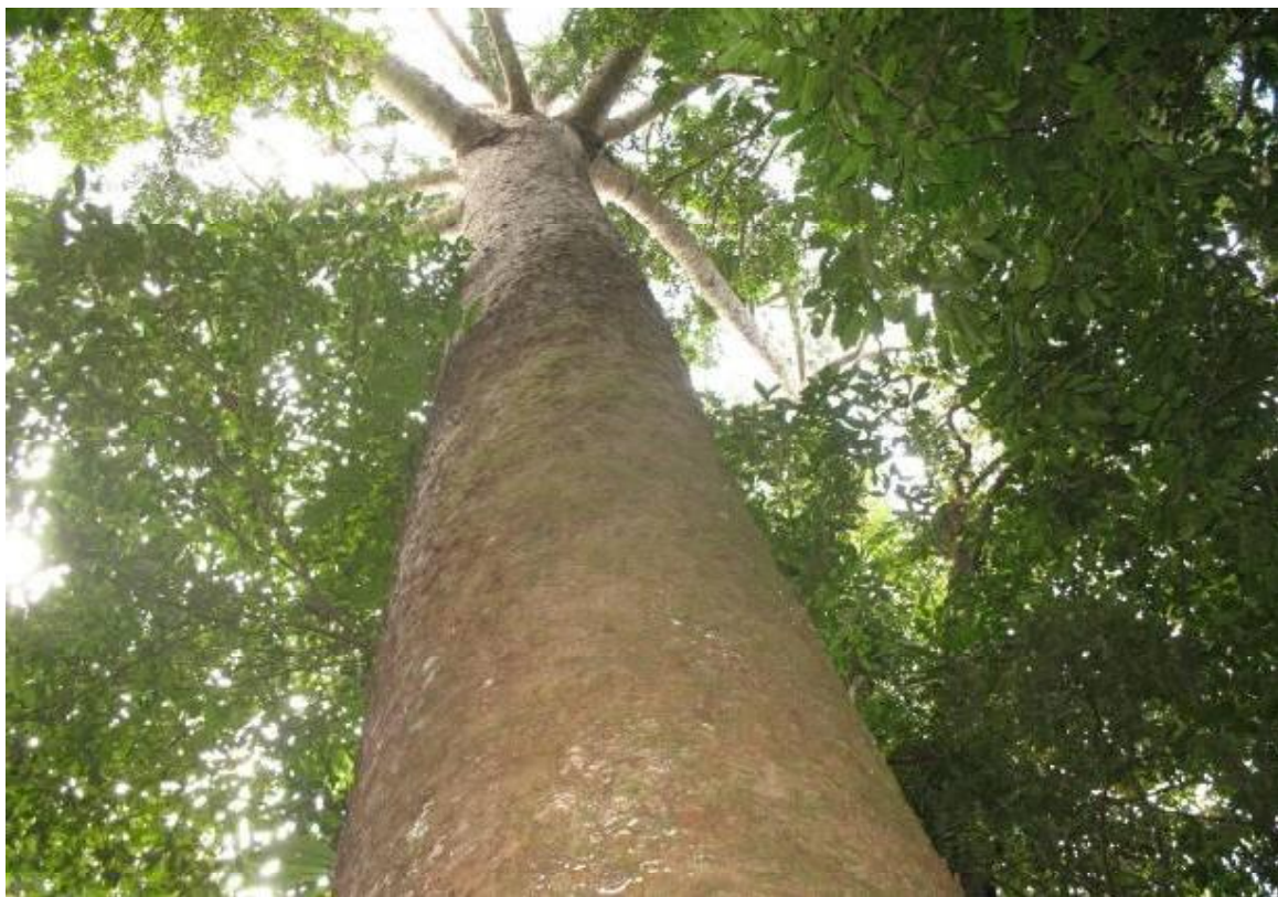
Queensland Kauri Pine ( Agathis robusta )

Council is committed to a vision of sustainability for the region which is demonstrated by continuously improving its environmental performance and working towards sustainability.