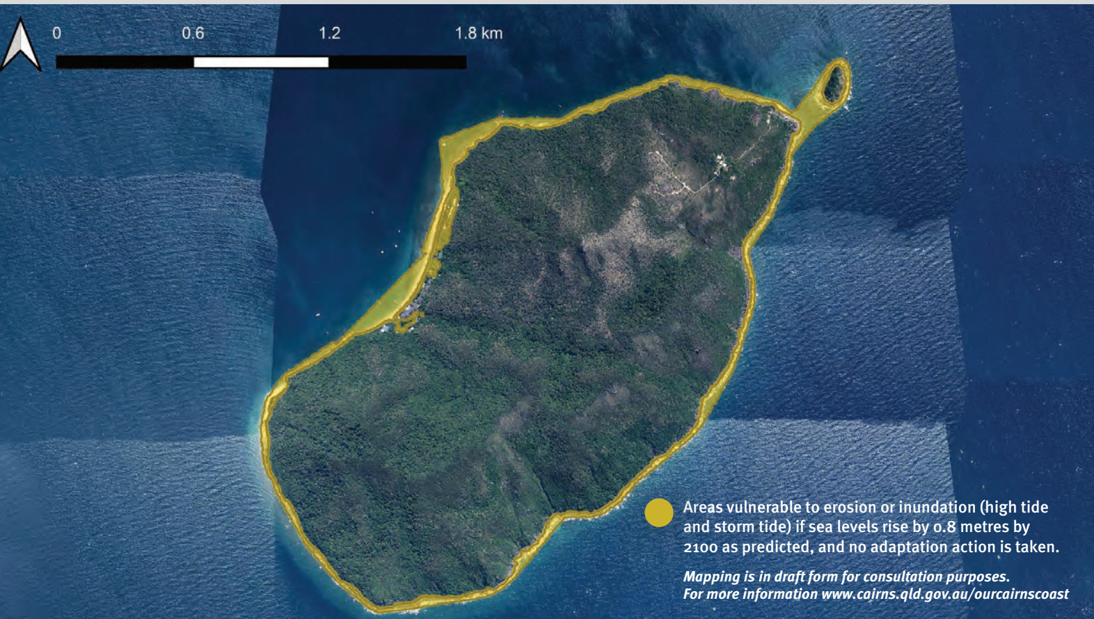
▲ FITZROY ISLAND

Fitzroy Island and Green Island are tropical islands less than an hour's ferry ride from Cairns. They are popular spots for day-tripping and snorkelling and have resort accommodation. 6000 year-old Green Island is the only cay in the Great Barrier Reef with rainforest cover.