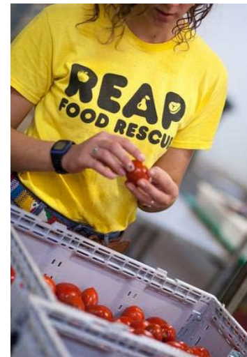
Reap Food Rescue, now OzHarvest