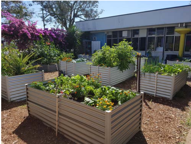
Yorkeys Knob State School P&C Community Garden