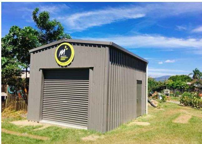
Manoora Community Garden shed