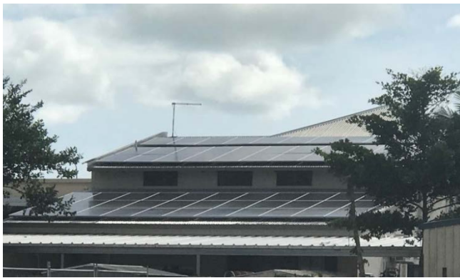
The Junction Clubhouse 19.8kw solar system