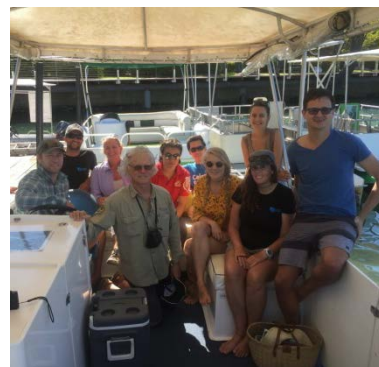
Mangrove Watch Cairns