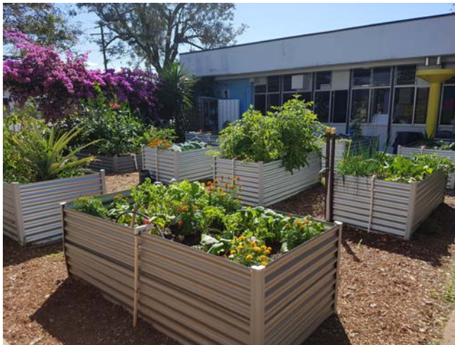
Yorkeys Knob State School P&C Community Garden