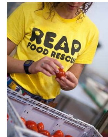
Reap Food Rescue, now OzHarvest