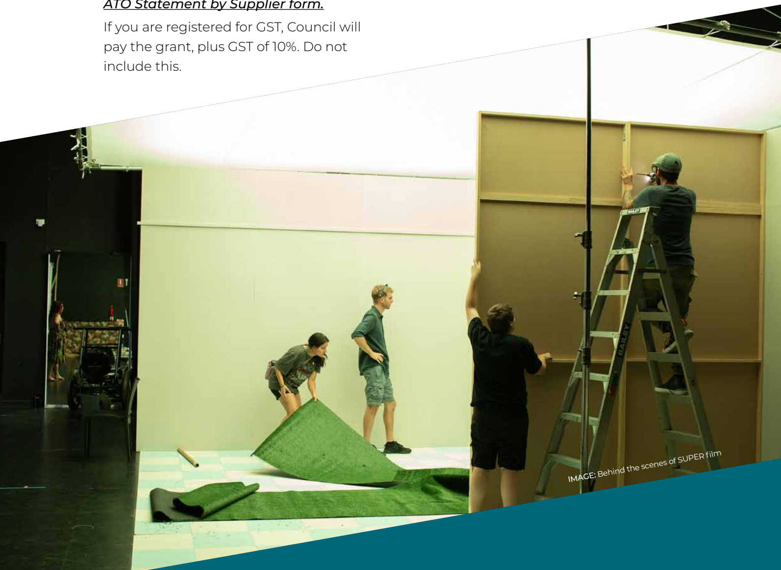
IMAGE: Behind the scenes of SUPER film

Survey resources are available from the Cairns Regional Council RADF webpage or by emailing radf@cairns.qld.gov.au .