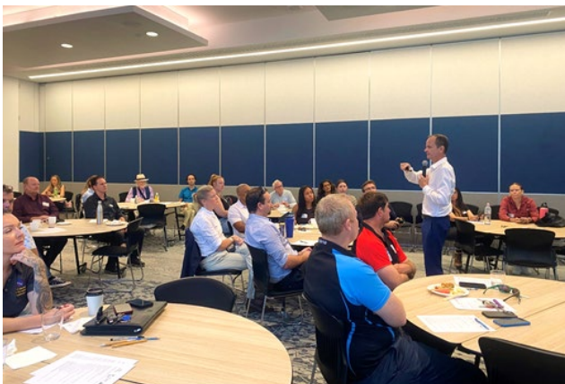
Local business representatives at workshop on Tender Readiness for renewable and major projects.

Building on this feedback, the second forum, Tenders, Energy Savings and Jobs for Sustainable Success , was delivered on 27 February 2026 in partnership with the Cairns Chamber of Commerce. This sold-out event featured a hands-on tender readiness workshop, advice on business electrification, insights into future workforce needs in renewable energy and critical minerals with presentation from TAFE Queensland, an EV bus tour and presentation provided by Tropic Wings and an exclusive site visit to CleanCo Queensland's Barron Gorge Hydroelectric Station. A second business survey demonstrated increased confidence in tender readiness, improved understanding of renewable energy supply chain opportunities, and strong interest in skills and training pathways. Collectively, the forums and surveys strengthened business capability and will inform Council's future engagement approach. This State Government Funded program assisted Council to support local participation in Queensland's energy transition.