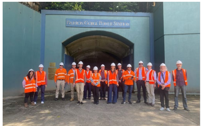
CleanCo Barron Gorge Hydroelectric Station tour.