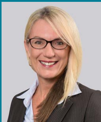
Your Division 6 Councillor is:

This newsletter from Cairns Regional Council is aimed at keeping you up to date with works, services and activities in DIVISION 6 which takes in Brinsmead, Crystal Cascades, Kamerunga, Redlynch, Freshwater and Stratford.