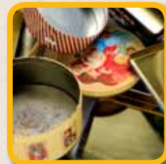
Chocolate and Biscuit Tins