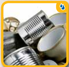
Steel Food Cans