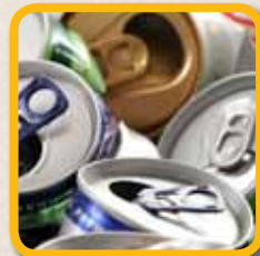
Steel and Aluminium Drink Cans