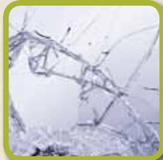
Broken Window/ Plate Glass and Mirrors