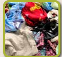
Clothing and Fabrics