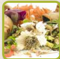
Household Food Scraps