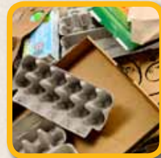
Cardboard including Pizza Boxes and Egg Cartons