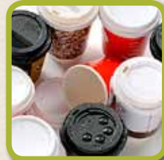
Disposable Coffee Cups