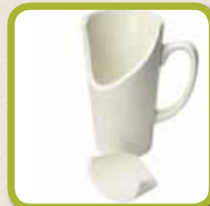
Broken Ceramics/ Crockery