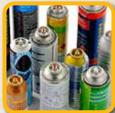
Empty Aerosol Cans including Hair and Insect Spray