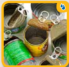
Aluminium Food Cans