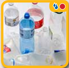
Drink and Milk Bottles