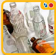
Juice and Soft Drink Bottles