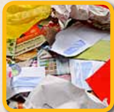
Junk Mail, Envelopes and Wrapping Paper