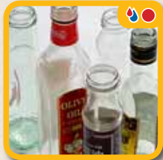
Oil, Sauce and Vinegar Bottles