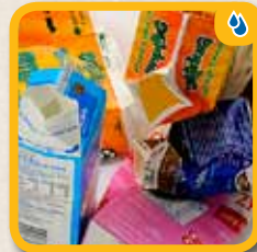
Milk and Juice Cartons