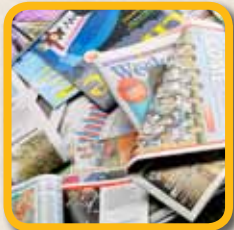
Newspapers and Magazines