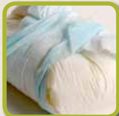
Dirty Disposable Nappies