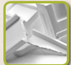
Polystyrene Balls/ Styrofoam