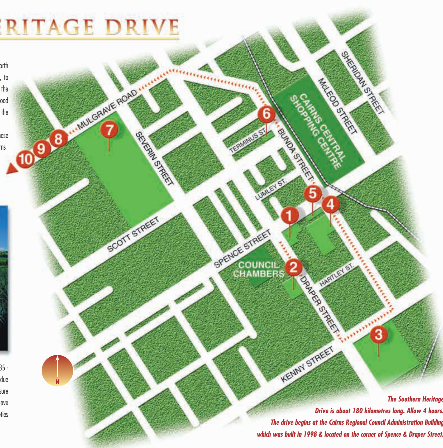
The Southern Heritage Drive is about 180 kilometres long. Allow 4 hours.

In the course of time, the Pyramid Mill southwest of Gordonvale (1885 - 1890), closed through disaster and the Hambledon Mill (1883 - 1991) closing due to the pressure of urbanisation, technological advancements and economic pressure of the industry. The historic Mulgrave and Babinda Mills still operate today, and have incorporated significant advancements in equipment with improved sugar varieties and a stream lined workforce to remain viable in the current economic climate.